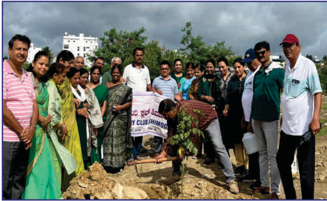
Planting of saplings at Rotary Bio-diversity forest, Gadikoppa