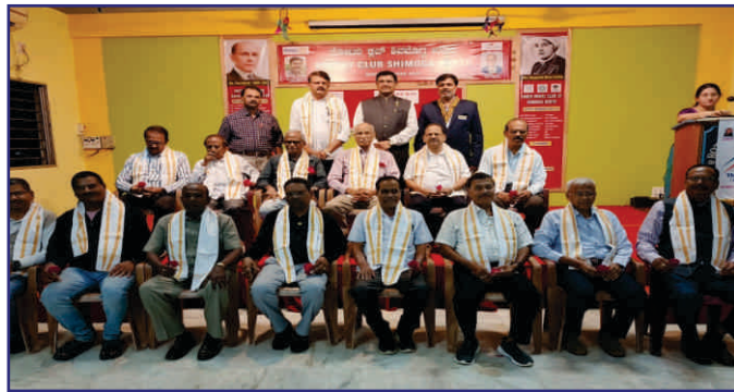
Celebrating Charter Day by honouring Past Presidents